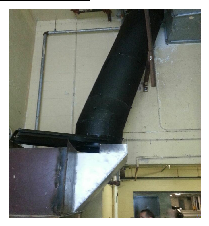
15 DEGREE CHUTE W/ HOPPER EXTENSION