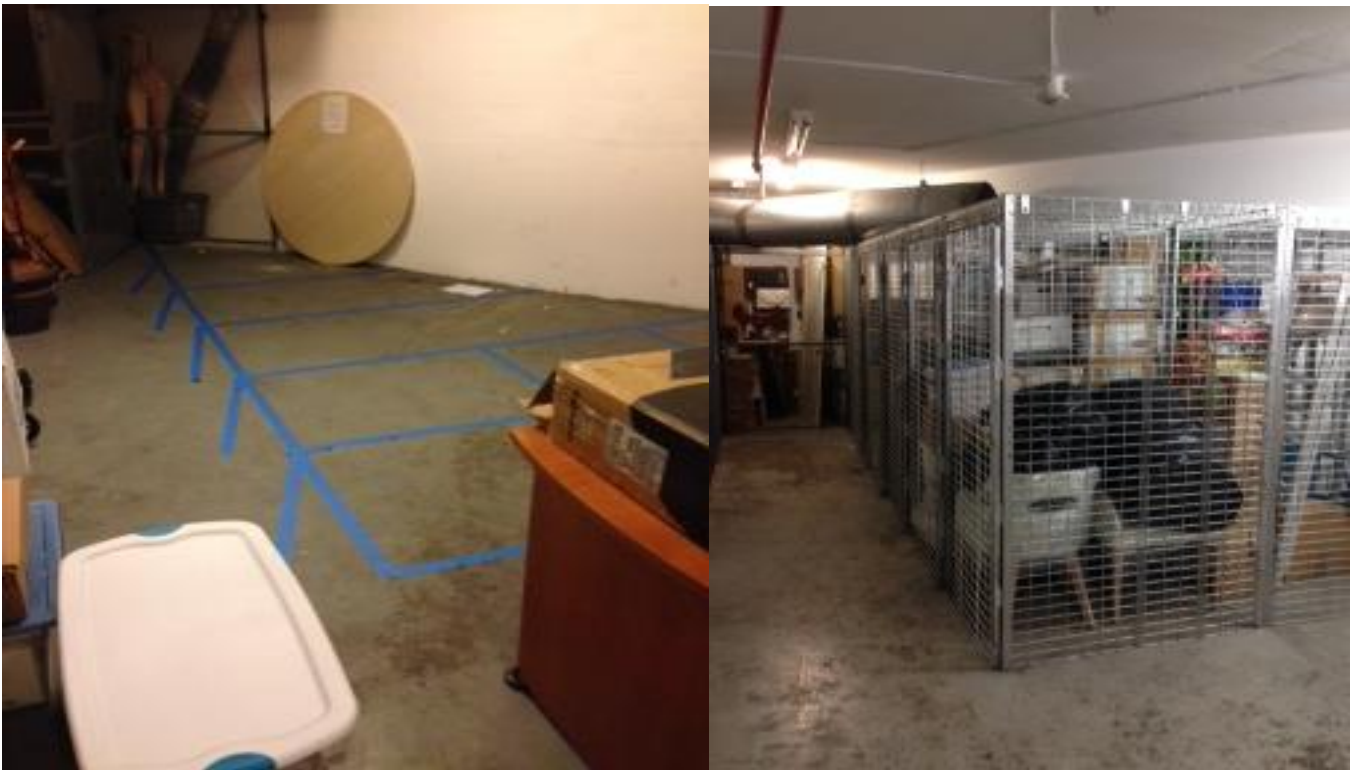
Proposed Layout Marked In Blue Tape On Floor ; New Lockers Installed Per Blue Tape On Floor